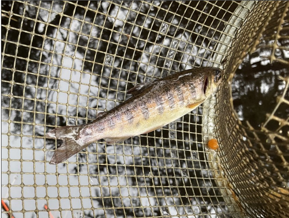
Figure 1.—Juvenile coho salmon captured at waypoint 1696.