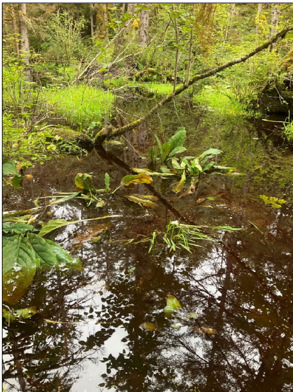
Figure 2.—Ponded water at waypoint 1696.